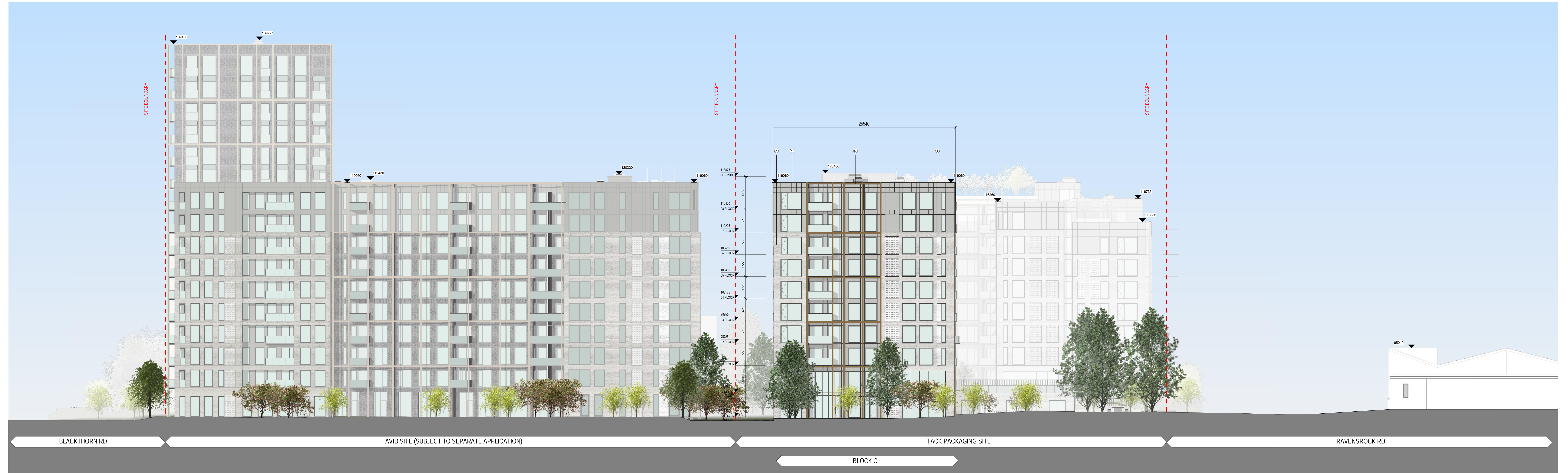
3 PROPOSED NORTH EAST CONTEXTUAL ELEVATION 1:200